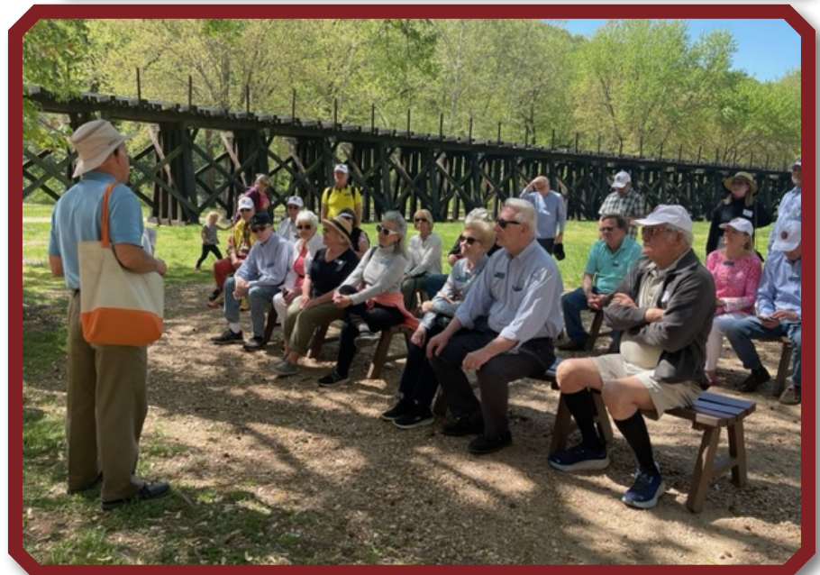
ODPC members listen to a National Park Service volunteer discuss the history of Harpers Ferry. In the background is the old railroad trestle.