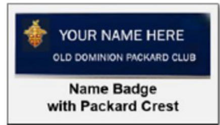
Name Badge with Packard Crest