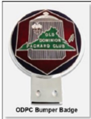
ODPC Bumper Badge