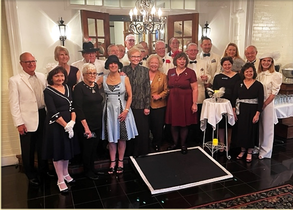
ODPAC members pose at the door to the dining room for the 2023 Spring Tour "Casablanca" Banquet