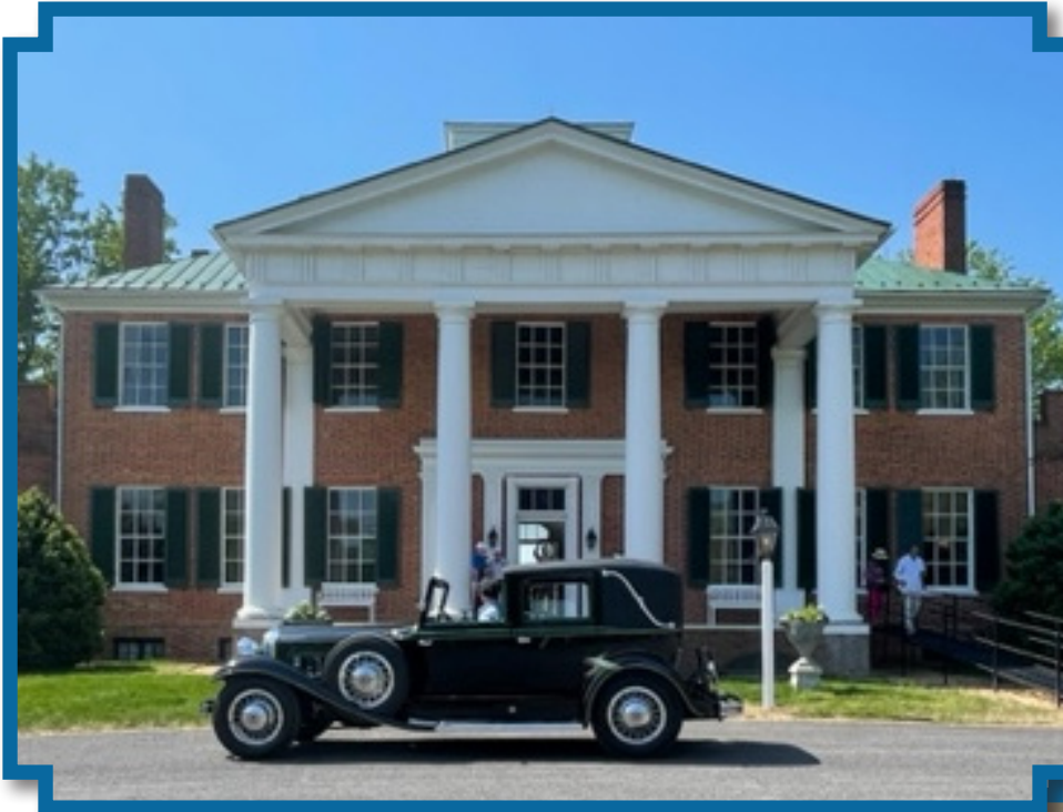
The Smucker's limousine in front of Long Branch House

Long Branch is a historic property that is a favorite for weddings and other events. The farm is also home for retired race horses.